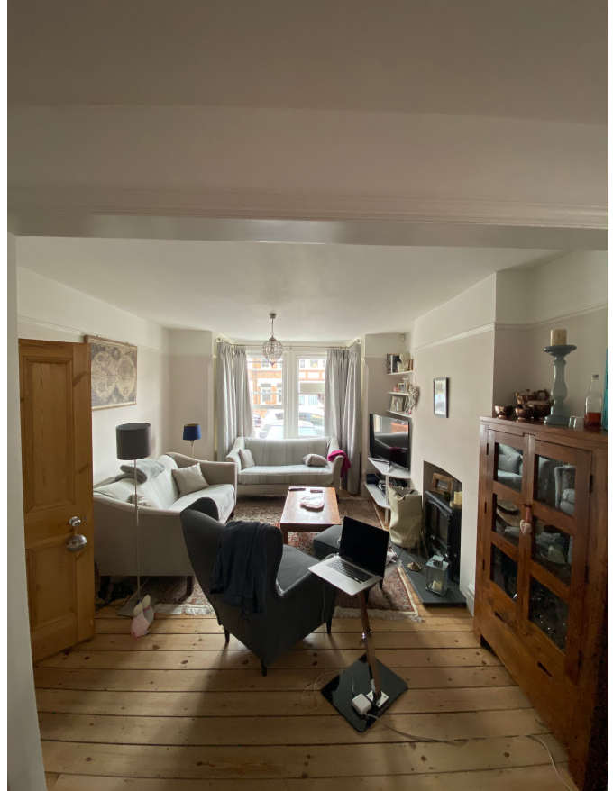
Ground floor with an ample kitchen and extended living room spaces.